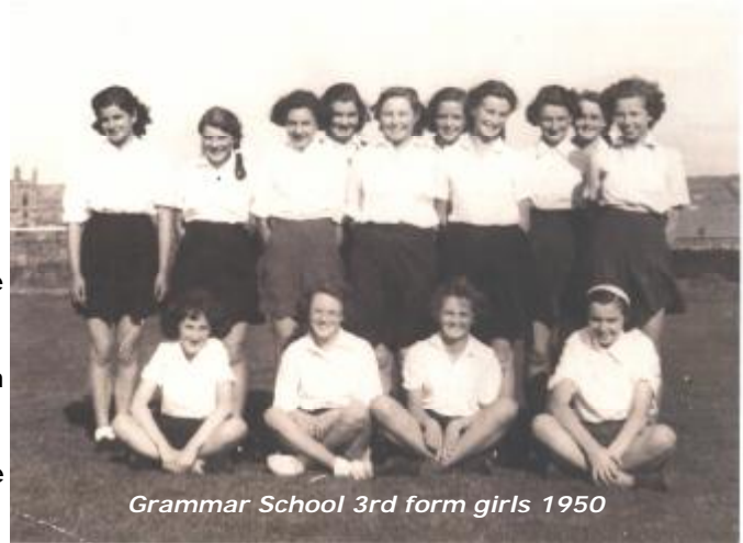
Grammar School 3rd form girls 1950

There will also be a third location for old teachers and